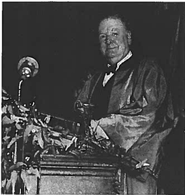
Winston Churchill giving his famous 'Iron Curtain' speech.

At first, the Americans did not really support this idea. But Churchill's speech made Stalin angry. In some ways, his speech was the start of the Cold War.